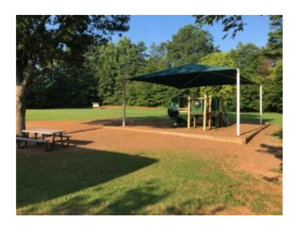
I will do lots of fun things at school. I will get to play outside at recess time.