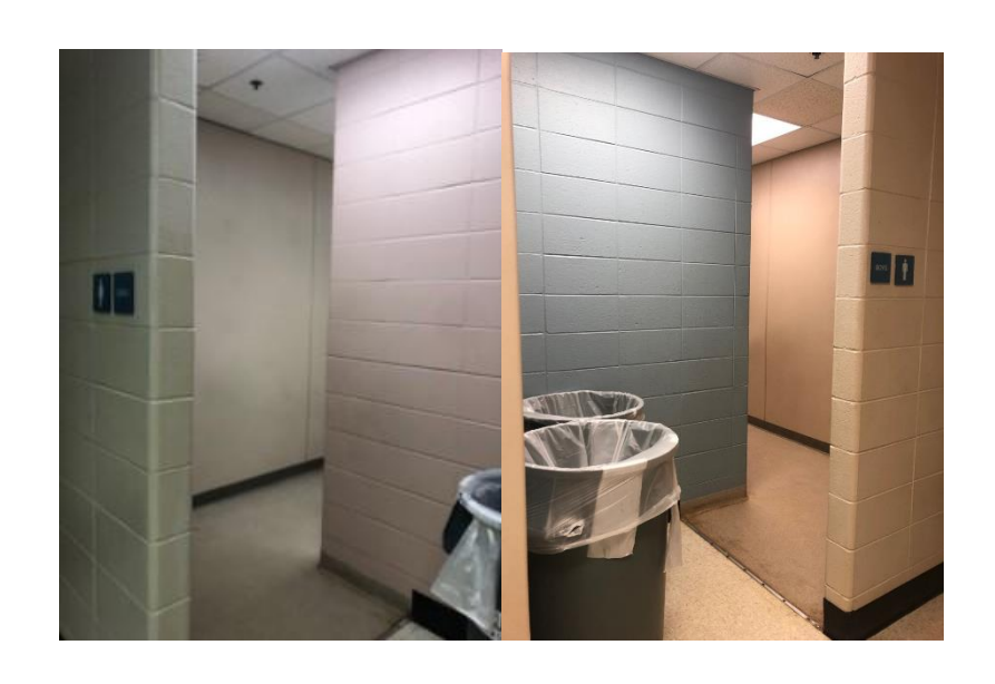
If I need to go to the bathroom, this is where I will go.