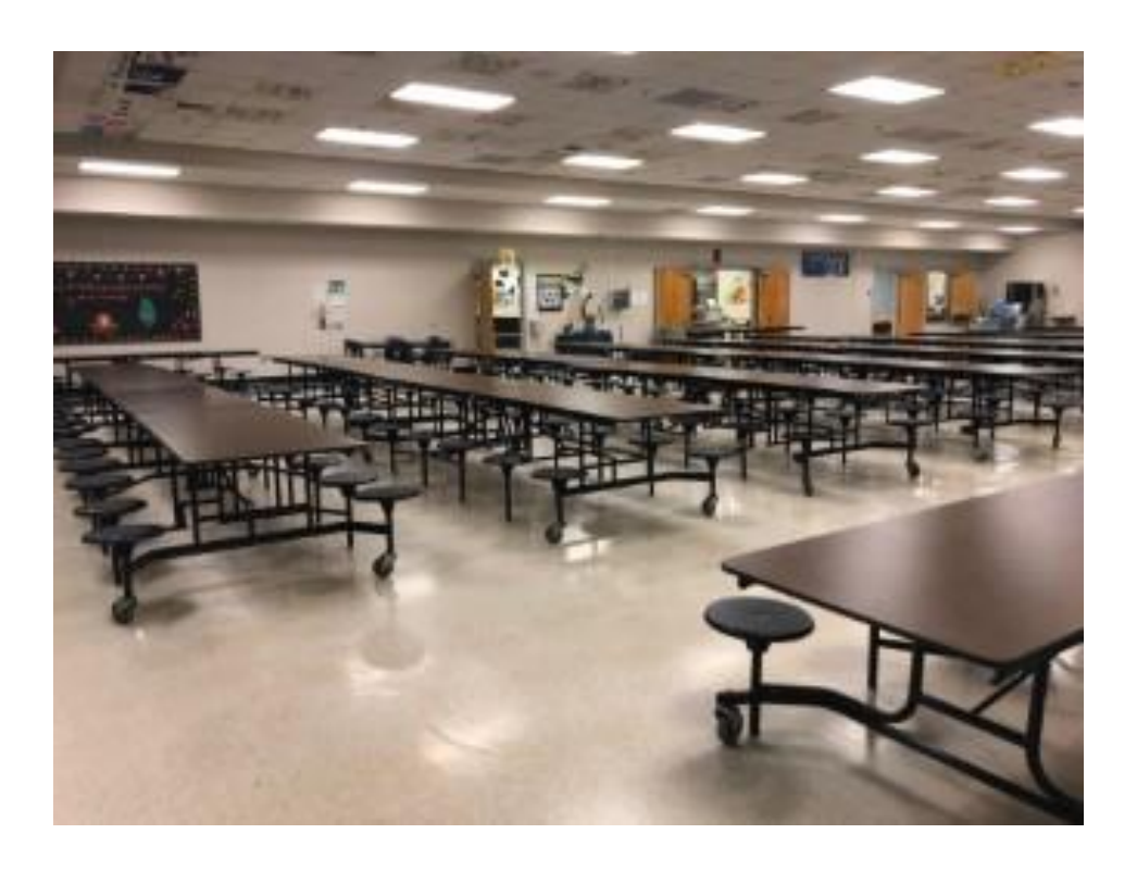
I will eat lunch with the rest of the kids.