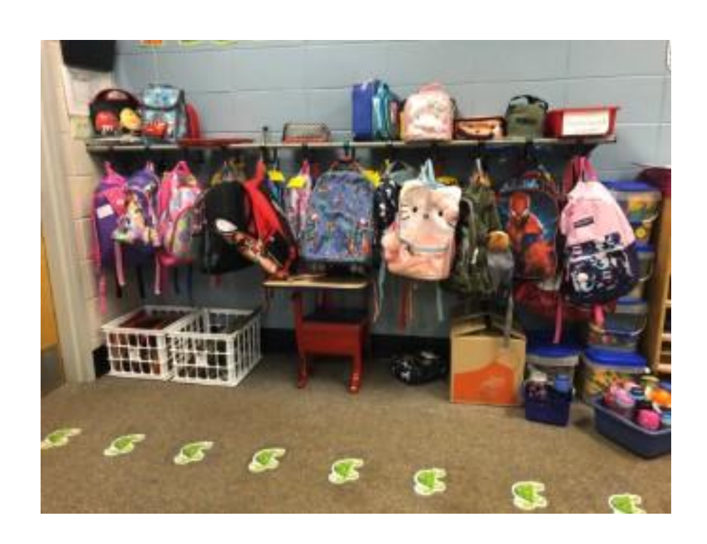
I will walk in and put my backpack and lunch box away.